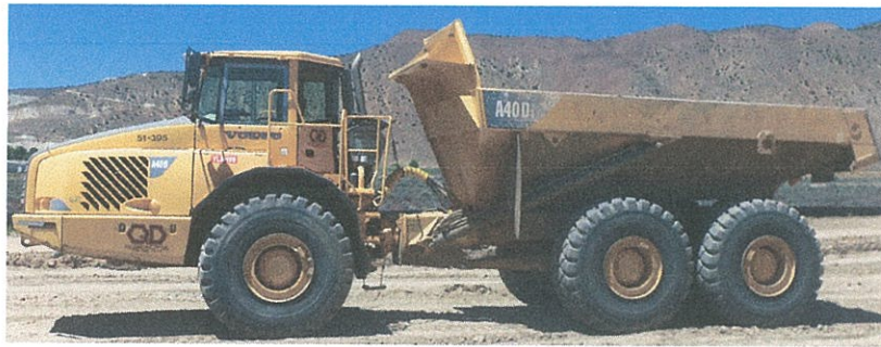
Large dump trucks: