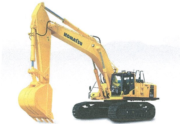
even a track back hoe:

all the above items are covered under the category of "Operable Vehicles."